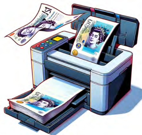
An AI's visual interpretation of the cost of printing

Please let me know your thoughts at news@braybrooke.news , or alternatively, I will be at the Annual Parish Meeting on 3rd March, where I'd be happy to discuss ideas.