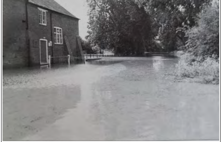
Flooding in June 1980. The water reached the Baptist Chapel door.

I first came to live in Braybrooke with my parents in June 1976, just before the start of the long hot summer. When it broke in September there was heavy rain and we woke up one morning to find flood water on Newland Street just below our house, (No.10). Mr Hakewill's barns, which stood where numbers 7, 9, 11, 15 and 17 now stand were under water and old railway sleepers from the barns were floating down the road. It all came as a bit of a shock.